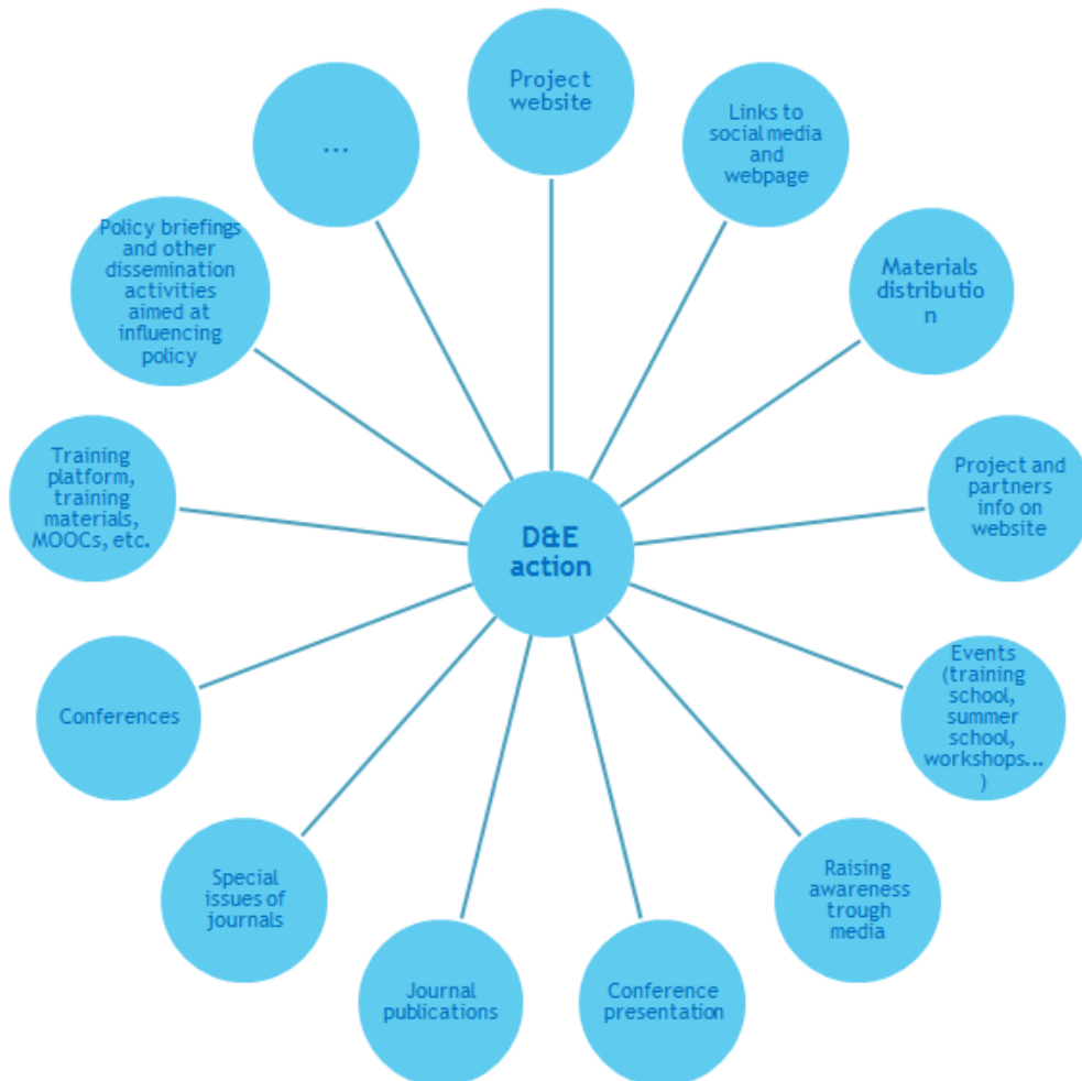
Figure 3. Dissemination Action types

The dissemination and exploitation plan is focused on an overarching approach involving different actions type summarized within the scheme below.