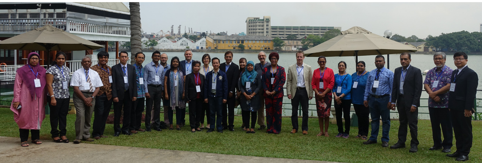
Photograph (above): Over 20 experts from 14 countries in the EU and Asia attended the CABARET project kick off meeting, in March 2017, Colombo, Sri Lanka