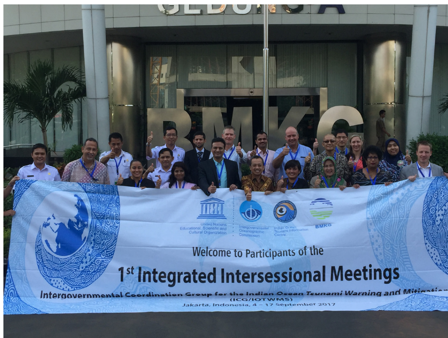
Photograph (above): CABARET partners attending the Intergovernmental Coordination Group for IOTWMS 1st Integrated Intersessional Meetings in Jakarta, Indonesia

The Sendai Seven Campaign is an opportunity for all, including governments,